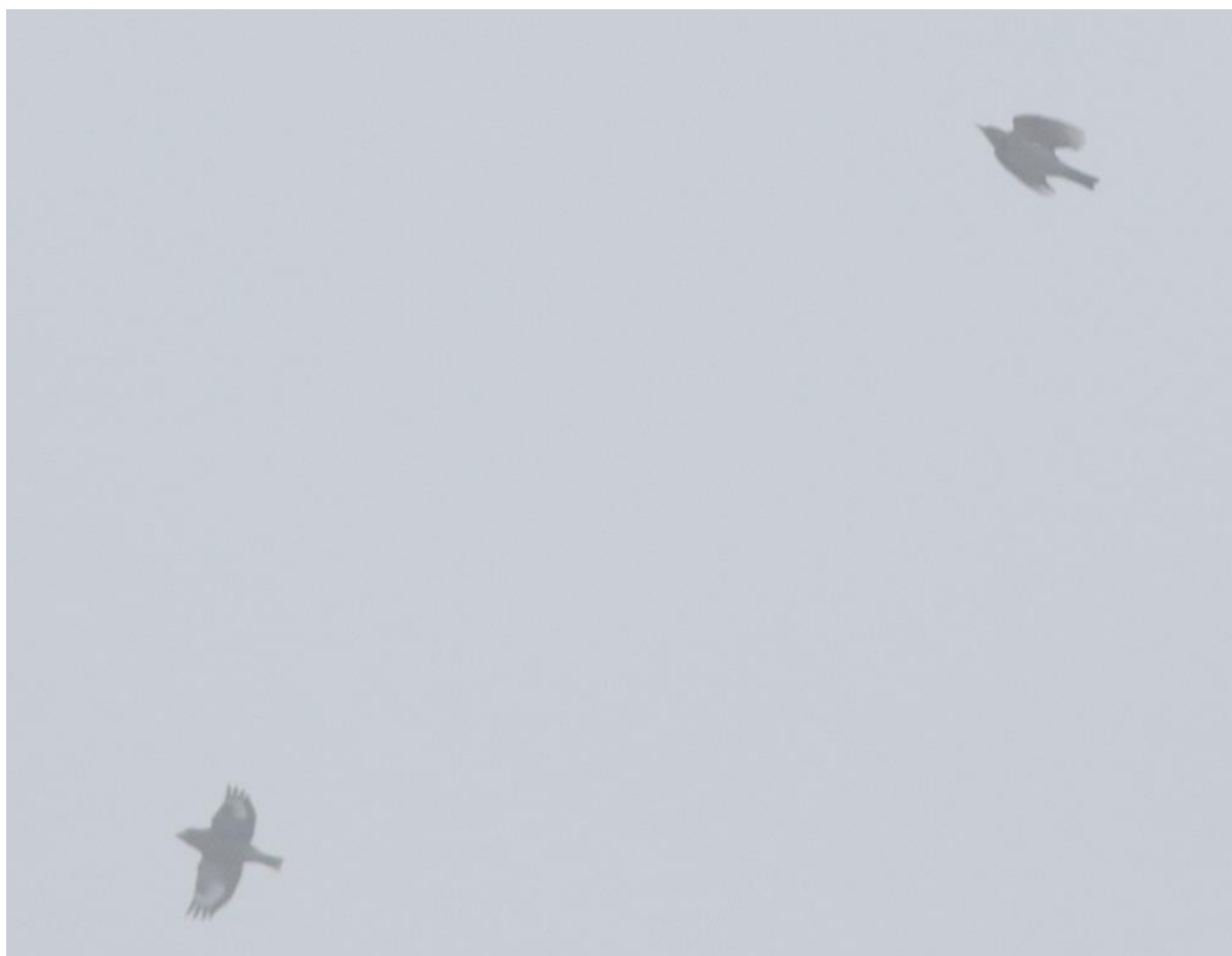
Hawfinch and Redwing, Harden, near Penistone, W Yorkshire, Oct 2017.