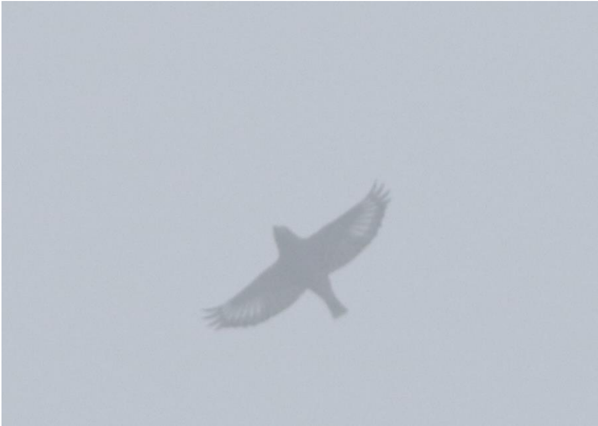
Hawfinch, Harden, nr Penistone, W Yorkshire, Oct 2017.