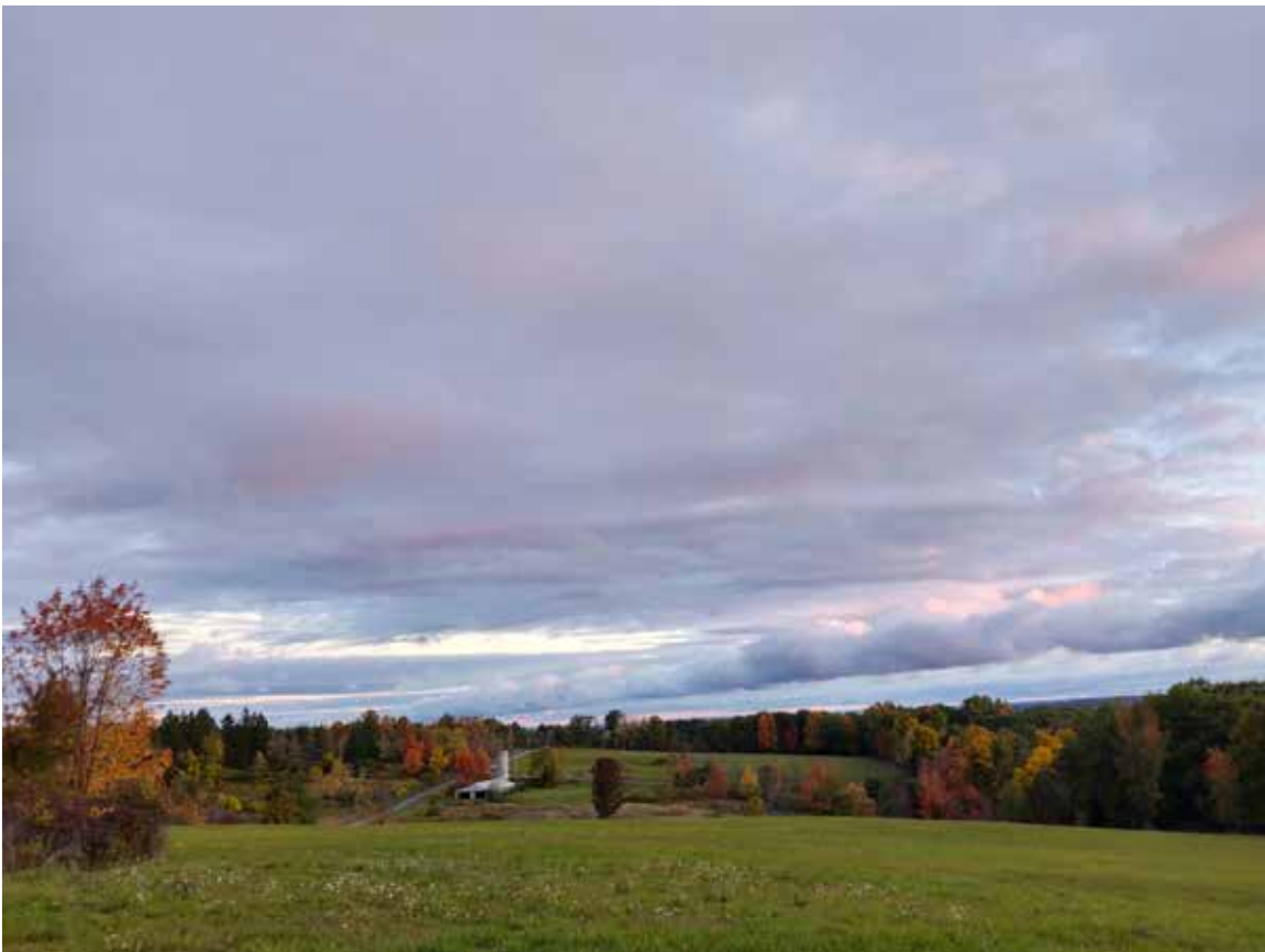
View from the "Cayuga South" count site looking NNW on October 8, 2020.

As this year's broad-spectrum finch irruption expanded, I happened to be taking a daily core sample of morning flight activity from a vista walking distance from my home, ~8 miles south of Ithaca NY (see picture of count site below). This morning watch had been evolving since fall 2017, when I first utilized the site to study southbound loon migration off Cayuga Lake and Lake Ontario. This year, because of the pandemic, I had no out-of-town work travel, did not have to drive kids to school, and everything seemed to line up to do daily counts for an hour or two each morning. I started August 4 with the intention of logging early-season American Robin movements and only have missed one morning as of this writing. I'm so thankful for the opportunity - for the peace of mind that's resulted, for the deeper connection with birds, and the front-center seat for this fall's eye-opening departure of finches and other species out of the Boreal.